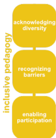
Figure 1: Perspective of Inclusive Pedagogy