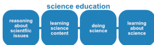
Figure 2: Perspective of Science Education

the previously described perspective of inclusive pedagogy (Fig. 1), they informed the second perspective of our scheme of inclusive science teaching and learning (Fig. 2).